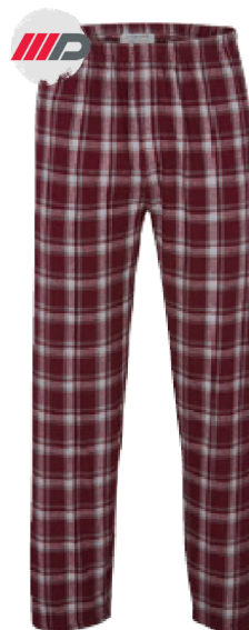
HEM Heritage Maroon Plaid