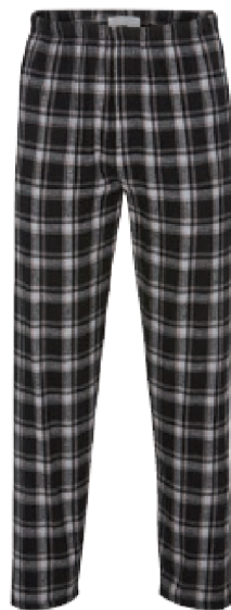
HEB Heritage Black Plaid

Plaids consist of crossed horizontal and vertical bands in two or more colors. Plaids have many variations of band width, repeat and/or color.