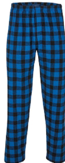
RKB Royal Black Buffalo Check