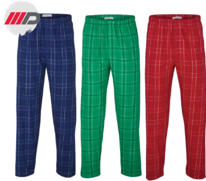
FD1 Navy Field Day Plaid

Minimalist approach to a modern pattern. Bright color palette with white and tonal intersecting lines.