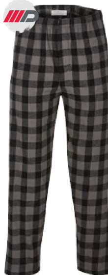
CKB Charcoal Black Buffalo Check