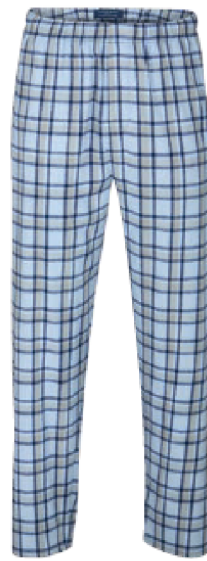
HNC Heritage Carolina Blue Plaid