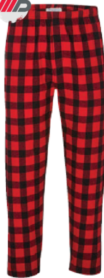
RBB Red Black Buffalo Check