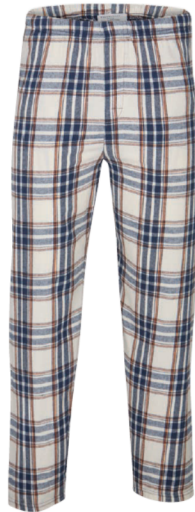
MP1 Orange Indigo Metro Plaid