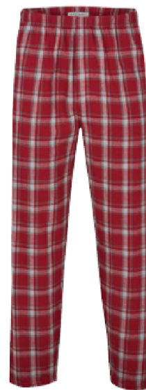
HGP Heritage Garnet Plaid