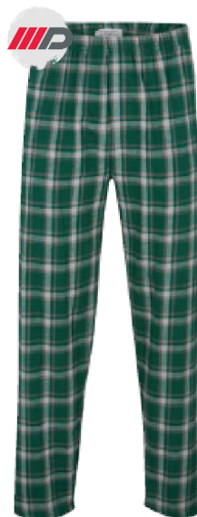
HEH Heritage Hunter Plaid