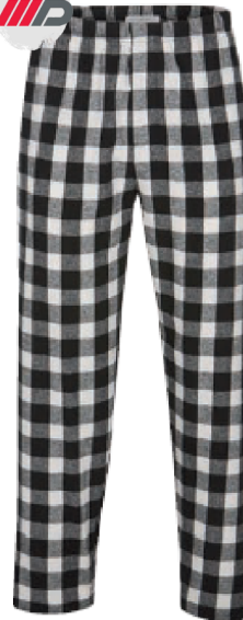
BWF Black White Buffalo Check