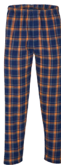
HOG Heritage Navy Orange Plaid