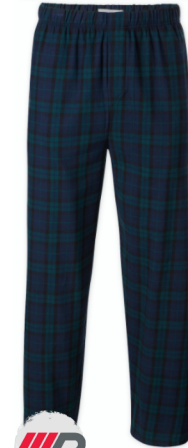
///D STP Scottish Tartan

Instant classics with bold colors and styling.