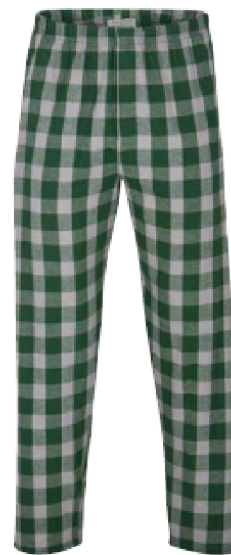
BCG Green Charcoal Buffalo Check